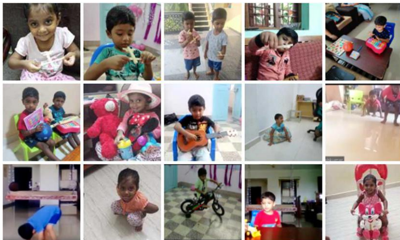
Show me Five & Transport Playtime

Our Nursery students had a special day of "Show me Five" this week. They showed their friends their top five favourite things. They also created aeroplanes out of ice cream sticks. They pedalled bicycles and did animal walks as a part of their gross motor skills.