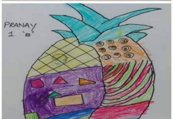
PRANAY 1 '8