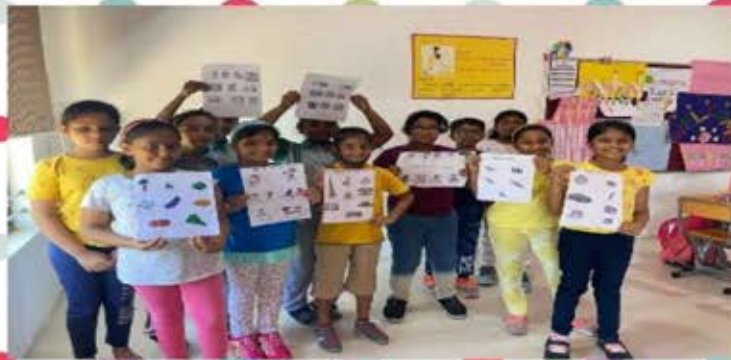
Grade 5 CB