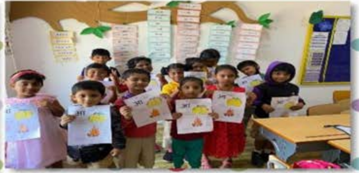
Grade 1A & 1B