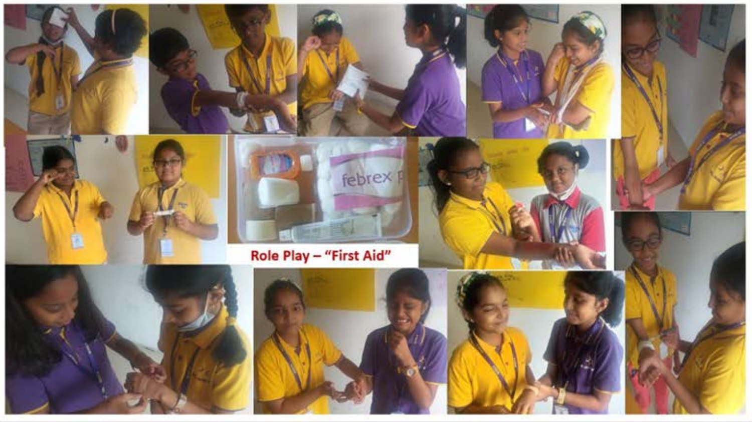
Role Play – “First Aid”